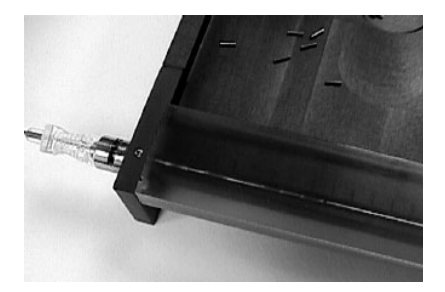
Figure 1. The Seed Slider shown with a train of seeds and spacers being loaded with a needle stylet

The Seed Slider eliminates the risk of dropping seeds since seeds are never picked up from the Slider tray. Implant needles lock securely onto one side of the Seed Slider with a luer lock fitting.